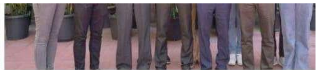
Students and faculty after a workshop on career choice at Model Christian College in Kohima