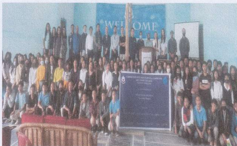
Newspaper clipping (The Morung Express-18.03. 2022)