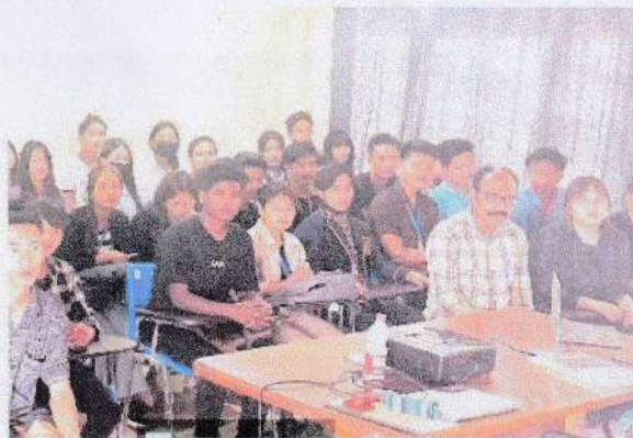
Students and faculty attending the seminar at Sao Chang College on Tuesday.

People with a strong sense of self-awareness are better able to identify their own strengths and weaknesses, he said, adding that while technical skills and cognitive abilities are important, emotional intelligence is a significant predictor of success today.