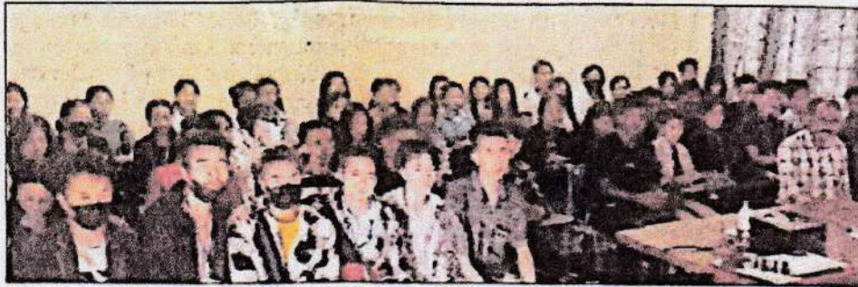
Students of Sao Chang College at the programme.