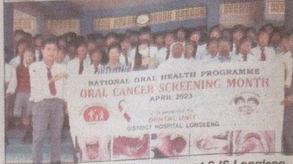
Participants of awareness program at SJS Longleng.