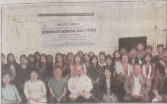
Participants of the seminar at Sao Chang College.