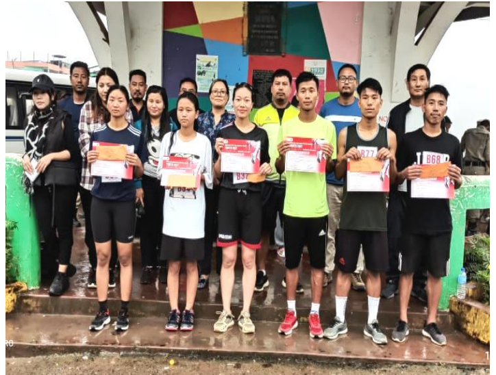
RED RUN- 5 Kms Marathon