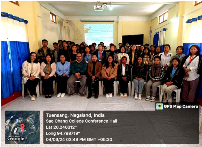
Intensive Music workshop