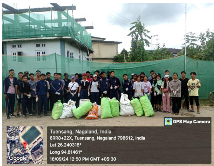
Swachhata Hi Seva