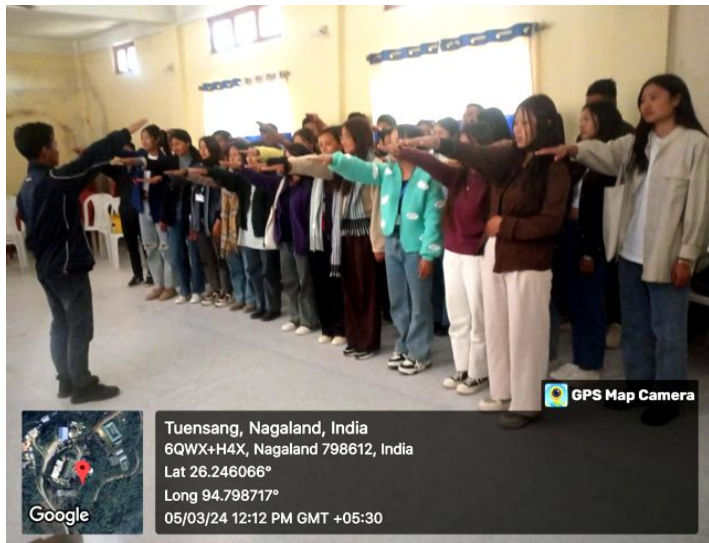
Voters Awareness Camp