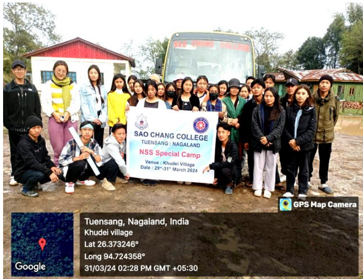
NSS Special Camp at Khudei Village