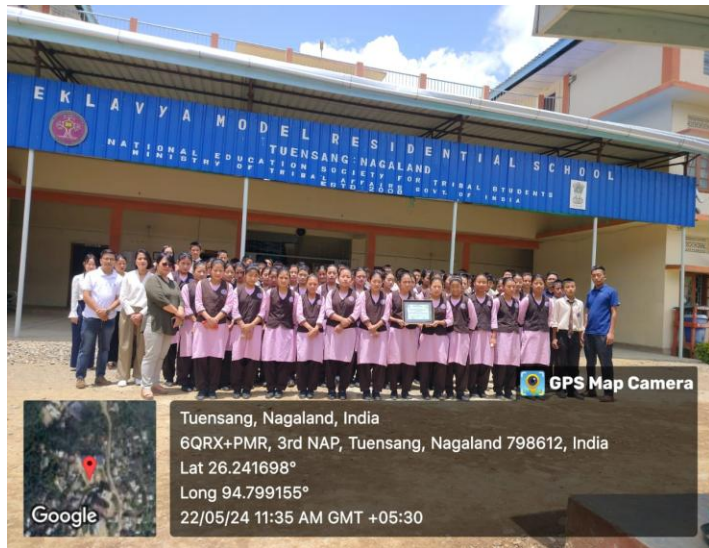
Biodiversity Day at EMRS School