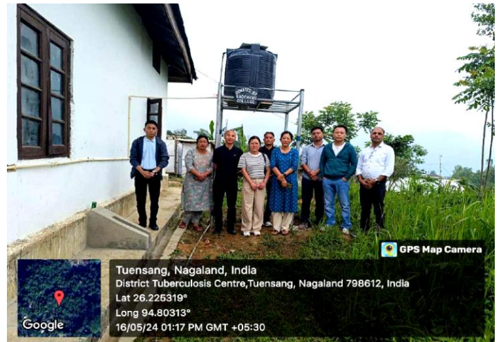
Ext. service to District Tuberculosis Office , Tuensang