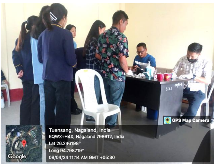
Blood Grouping & HIV Screening Test