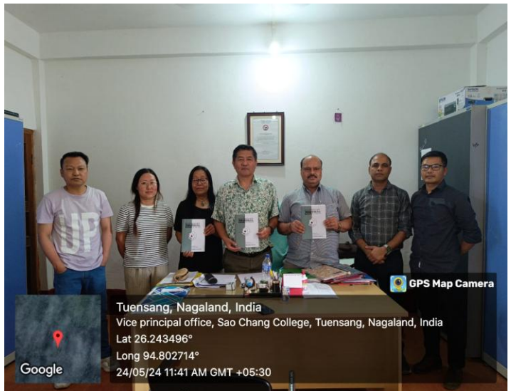
Release of College Journal (Peer Review)