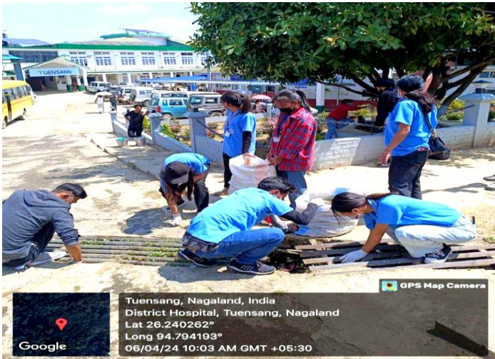
World Health Day