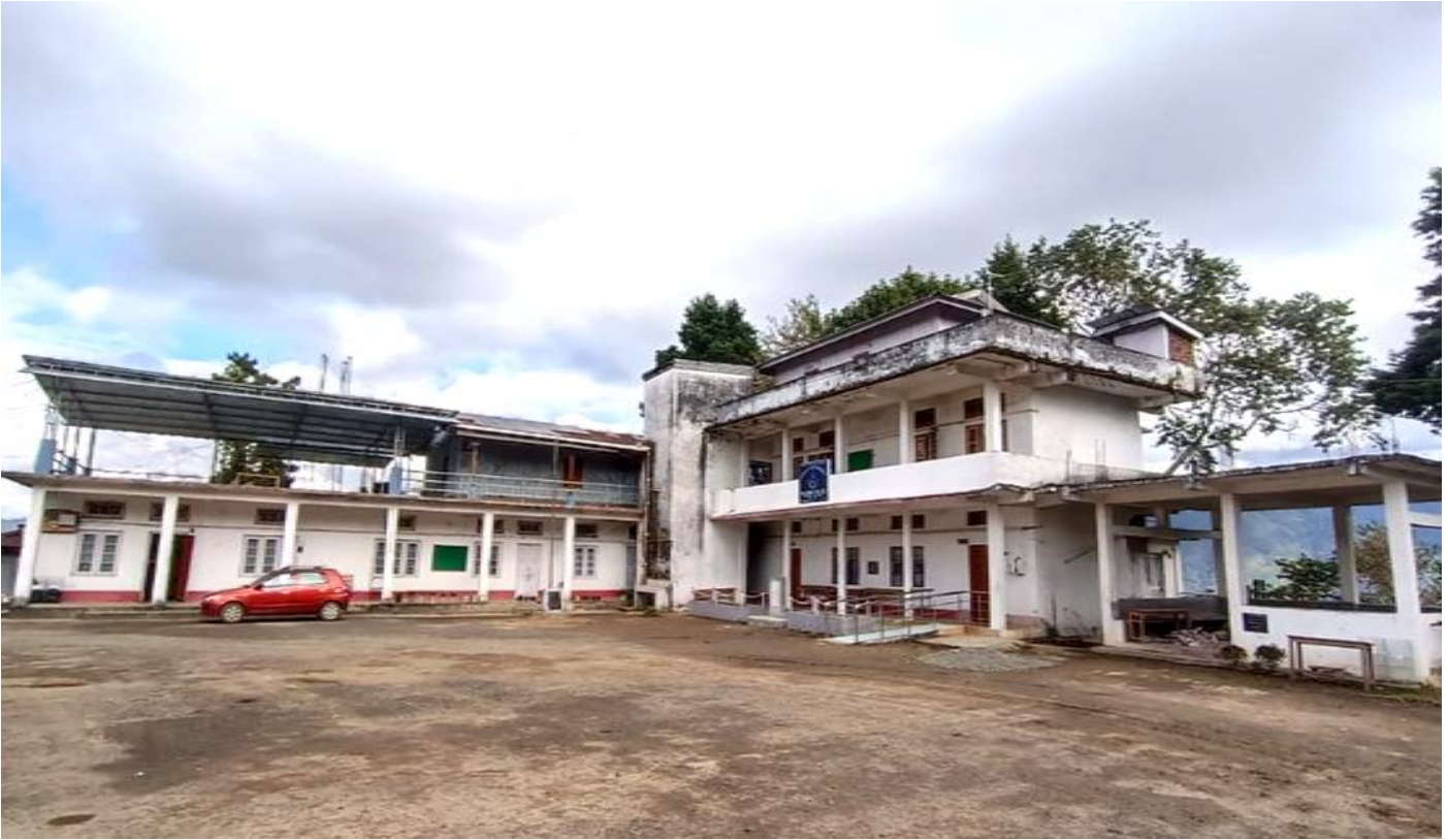
Administrative and Establishment Block