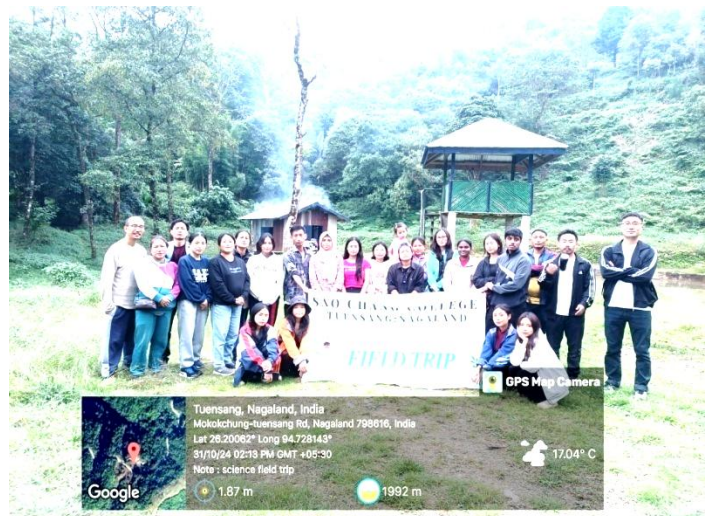
Science Field Trip