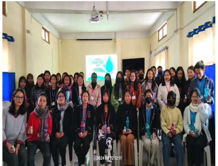
World Water Day