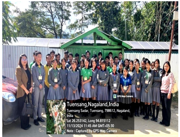
Career Counseling and Mental Health