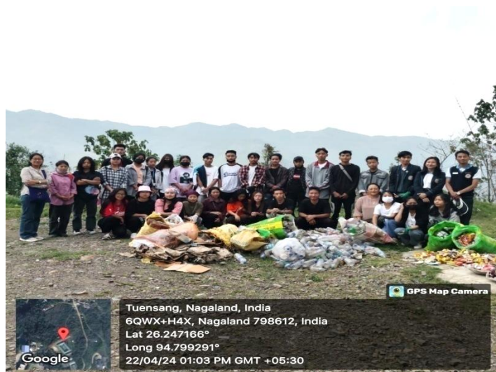
Waste Management and Recycling Workshop