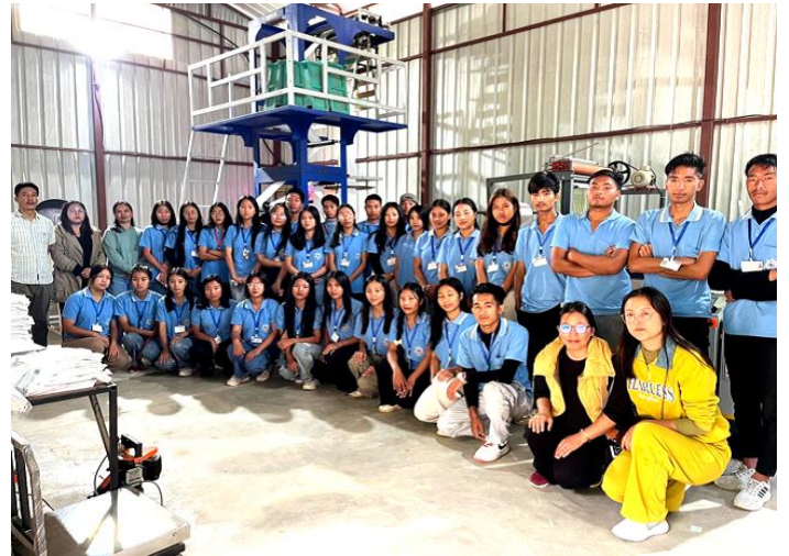
Industrial Visit To Sutsung Enterprise, Changtongya