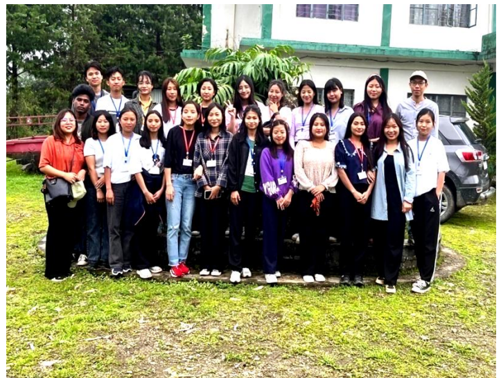
Flori (Vocational) Fiels trip to KVK Farm