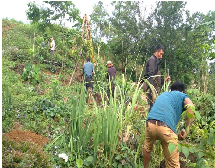
Coffee Plantation- WED