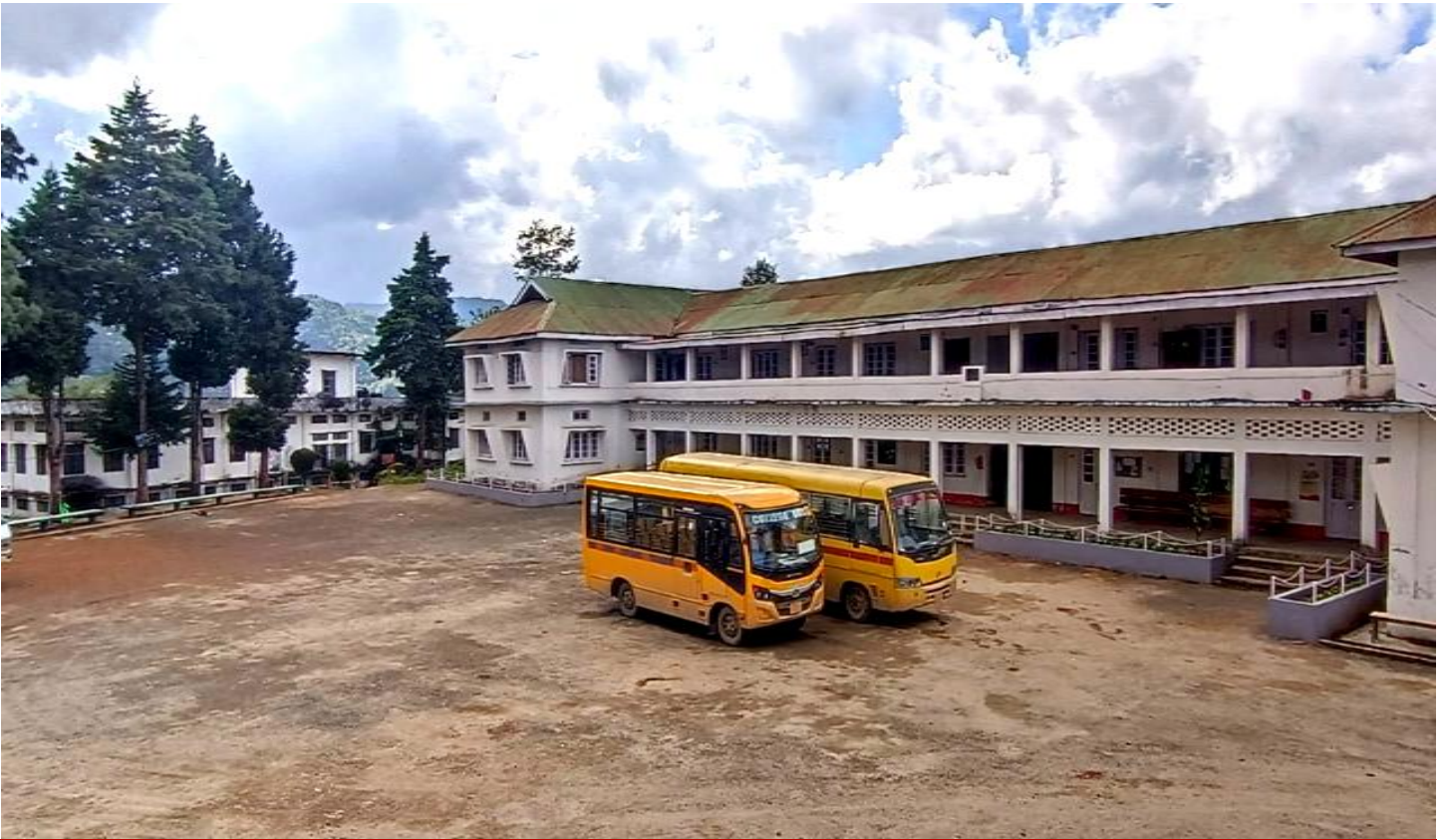
Arts and Science Block