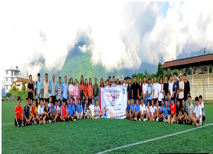
National Sports Day